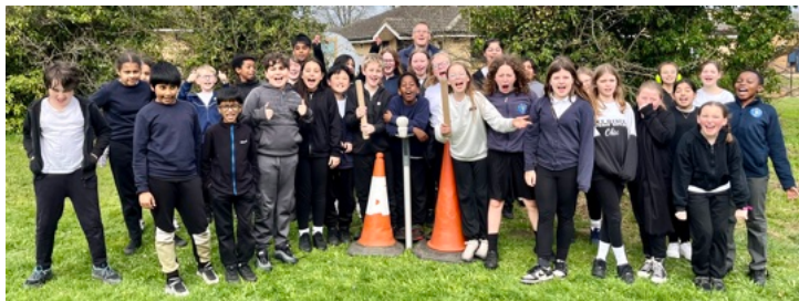
Enjoying The Aunt Sally