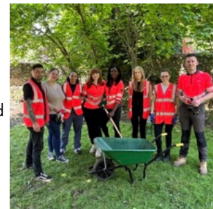
The team at LVH