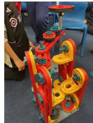
Engineering meets art at JHNA

The Existing Littlemore House buildings have been completely cleared and the floors removed from the recreation hall. In the coming months the 1990's glass link buildings between the Recreation Hall and the North & South Wings will be demolished leaving three separate buildings. To date, over 500 of 1600 piles have been constructed: they form the foundations and basement walls for the new Littlemore House. Currently there are 4 piling rigs in operation and we expect the piling to be finished January 2025. Amanda Thompson, Laing O'Rourke