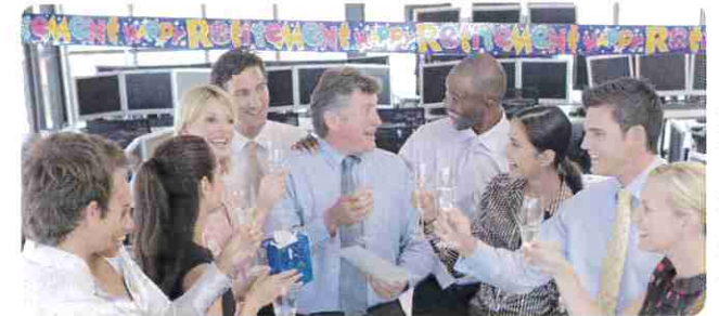
Retirement happens when an elderly person leaves work.