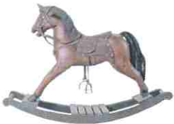
wooden rocking horse