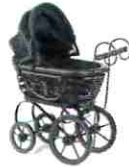
wood and metal pram