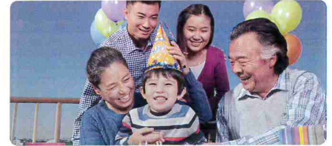
Birthdays happen every year.

Important life events include birthdays, religious festivals or family celebrations. Some life events happen every year and some happen at certain stages of human life.